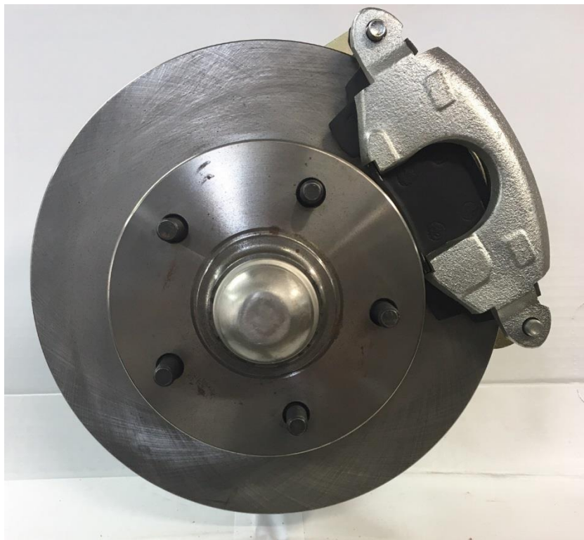
← Front of Car